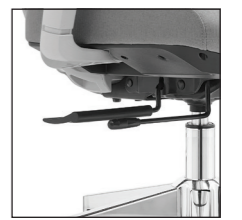
Height Control & Recliner Lock