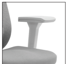
4D Adjustable Armrest