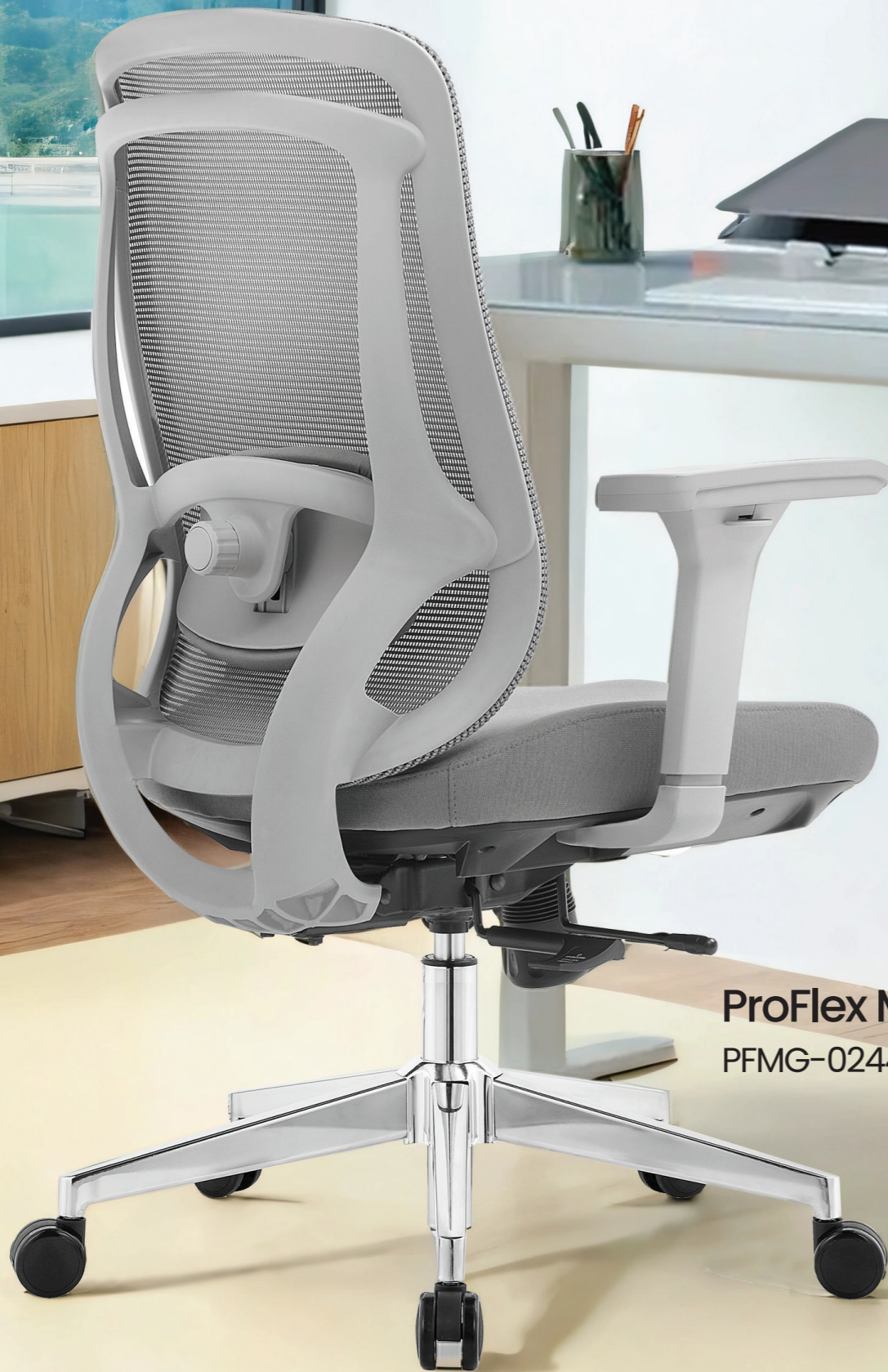
ProFlex Mid G PFMG-0244