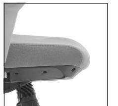
Seat Sliding Control